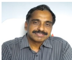
Regional Director RC Trivandrum

As part of enhancing the quality of academic support to the learners in Open and Distance Learning system and effective implementation of academic programmes at Learner Support Centres, Indira Gandhi National Open University organized a series of orientation programmes for its academic counsellors across the country. In this connection IGNOU Regional Centre Trivandrum hosted three zonal orientation programmes for academic counsellors of various disciplines.